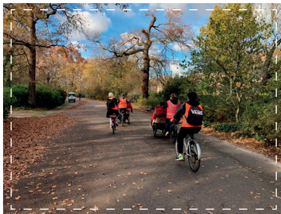
Volunteers drive the elderly, mainly living in retirement houses and drive them to trips to parks, city center, and some social events.